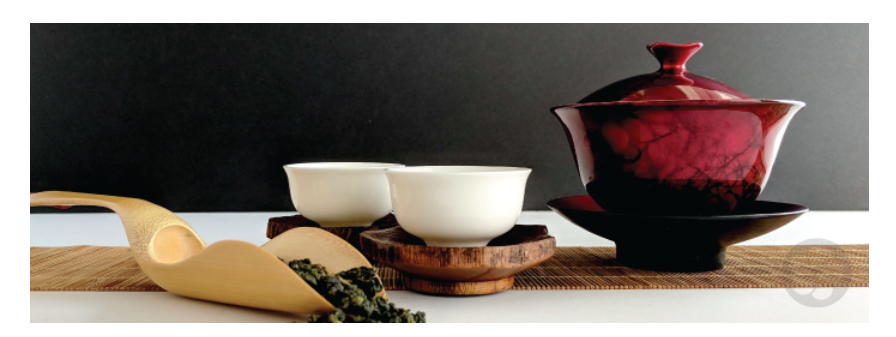
Image 3: The gaiwan is pictured in red on the right side of the above photo

brewed tea is most popular in Jiangsu and Zhejiang Provinces and is utilized to brew green teas, especially Dragon Well (龙井 longjing ) and Biluochun (碧螺春) teas<sup>17</sup>. In these provinces of China, one can oft see individuals sipping from clear tumblers in order to admire the tealeaves opening and floating around the water. In all three of these brewing methods, the individual brews the same tealeaves with freshly boiled spring water multiple times over in order to squeeze all of the taste and fragrance out of the leaves (Chen n.d., 12-14).