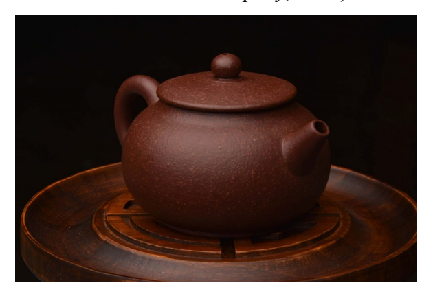
Image 4: The Boccaro teapot is pictured above (Verdant Tea 2018) This section gave a brief outline of what categorization of tea looks like in China, however there are many more ways in which tea can be categorized. Etherington and

the Gongfu method). The gaiwan method, rather, includes drinking tea straight from the gaiwan .